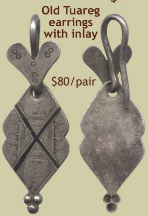
Old Tuareg earrings with inlay $80/pair