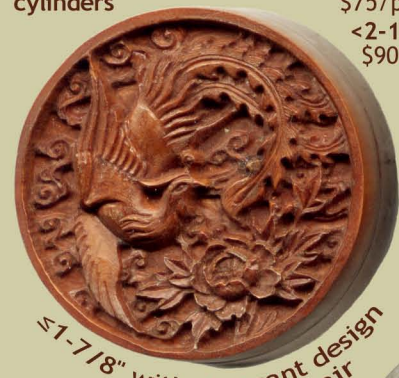
±1-7/8" with pheasant design $65/pair

Nepalese Newar women's dhungri conch jewelry $40/pair