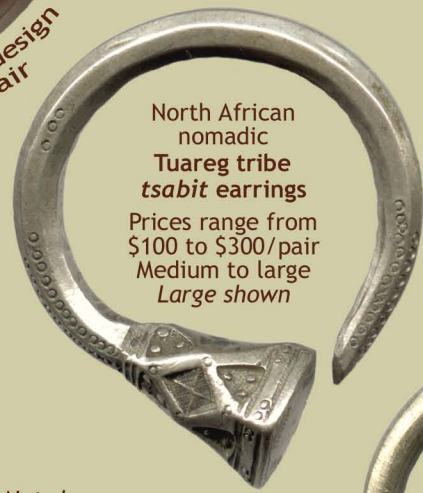
North African nomadic Tuareg tribe tsabit earrings Prices range from $100 to $300/pair Medium to large Large shown