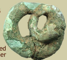
Khmer gilded bronze earrings circa 12th-14th century CE from Cambodia The smaller pairs are probably circa 900 CE $65/pair

$125 for two sets that are corroded together