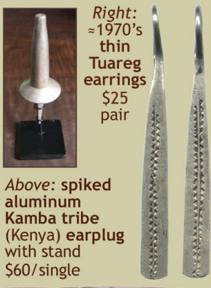
Right: ≈1970's thin Tuareg earrings $25 pair