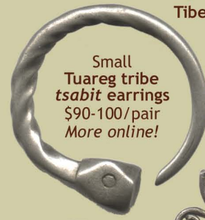
Small Tuareg tribe tsabit earrings $90-100/pair More online!