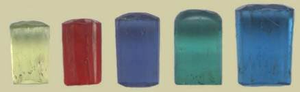
Burmese glass antique faceted earplugs Rare! Singles only. $40/each