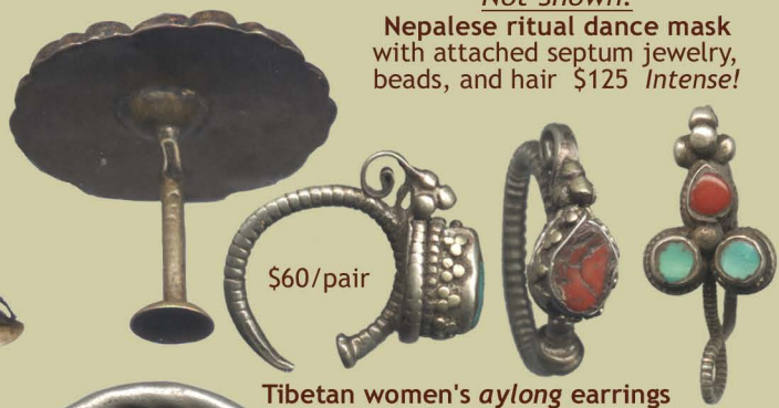
Tibetan women's aylong earrings with coral & turquoise inlays $60/pair

Not shown: Nepalese ritual dance mask with attached septum jewelry, beads, and hair $125 Intense!