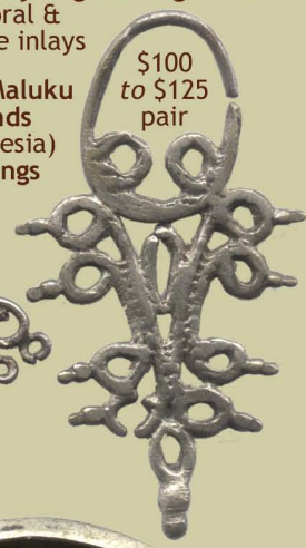
South Maluku Islands (Indonesia) earrings $100 to $125 pair