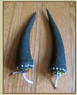
Rare beaded Burmese horn plugs (probably Naga tribe) Collected 30 years ago in Nagaland $75/pair

All prices listed are wholesale; retail prices are double.