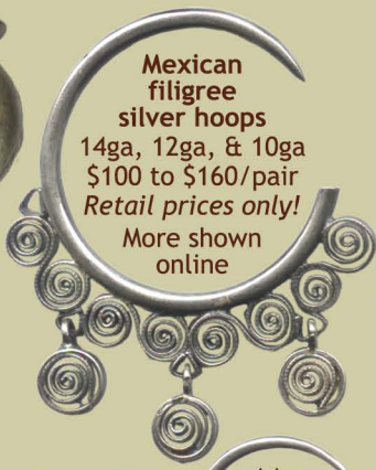
Mexican filigree silver hoops 14ga, 12ga, & 10ga $100 to $160/pair Retail prices only! More shown online