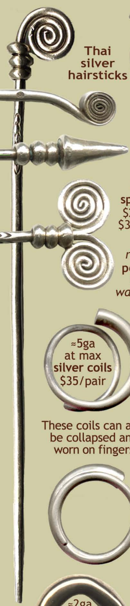
Thai silver hairsticks

left: spirals $24 to $30/ea or right: poppy buds waitlist