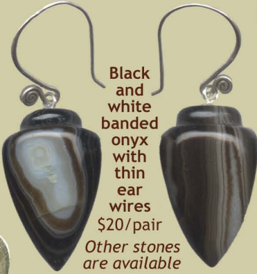
Black and white banded onyx with thin ear wires $20/pair Other stones are available