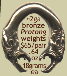
~2ga bronze Protong weights $65/pair .64 oz 18grams ea

Available in silver .78oz./22grams each ~$115/pair