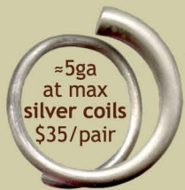
~5ga at max silver coils $35/pair

left: spirals $24 to $30/ea or right: poppy buds waitlist