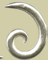
Left: ≤6ga Comma shaped silver spirals $60/pair