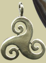
Silver triskel pendant $8