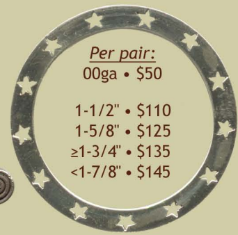
Per pair: 00ga • $50

On the left: the top unscrews; the bottom is hollow