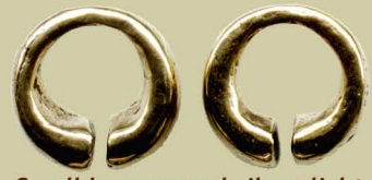
Small bronze and silver light earweights • $30 or $75/pair