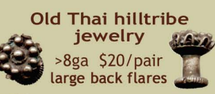
Old Thai hilltribe jewelry >8ga $20/pair large back flares