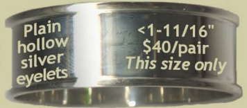
Plain hollow silver eyelets