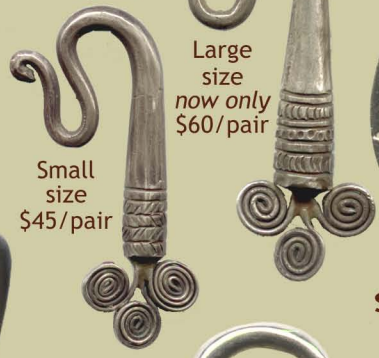
Large size now only $60/pair