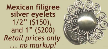
Mexican filigree silver eyelets 1/2" ($150), and 1" ($200) Retail prices only ... no markup!

Some of the hoops are more simple and do not have hanging attachments