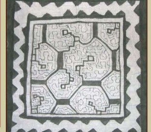
Below: Shipibo tribe ritual ayahuasca pattern cloth $30