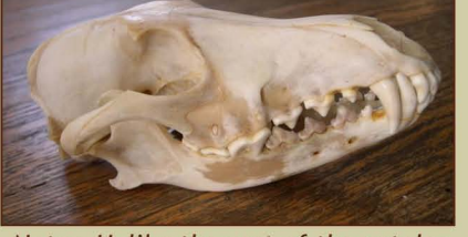
Below: Coyote skull $40