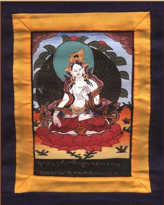
White Tara painting $30