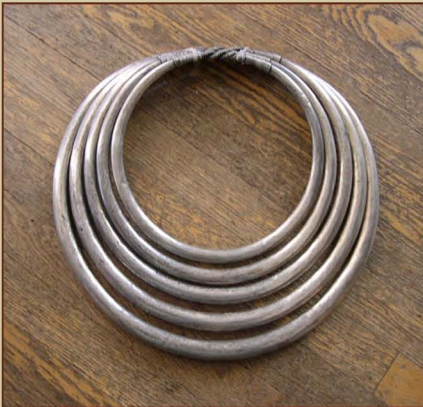
South China 5-tier collar necklace $165