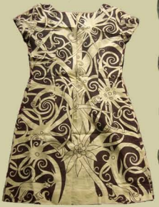
Kenyah Dayak tree of life dress (Borneo) $50