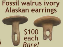
$100 each Rare!