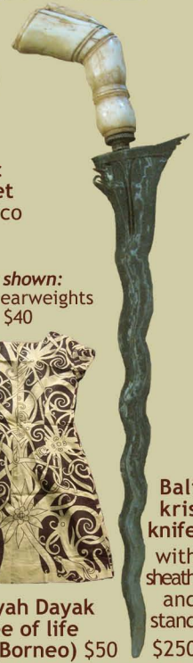
Bali kris knife with sheath and stand $250