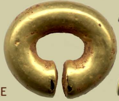
Panama (Veraguas) high karat gold foil over copper core septum ring c. 500-1100 CE