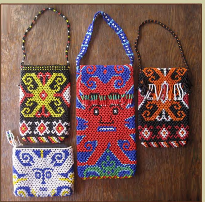
Above L: Dayak bags $20-25