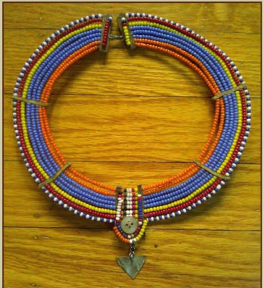
Maasai beaded necklace $100