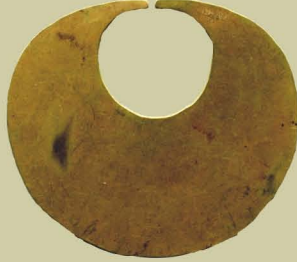
Gold septum from ancient Peru (Salinar) circa 400-200 BCE