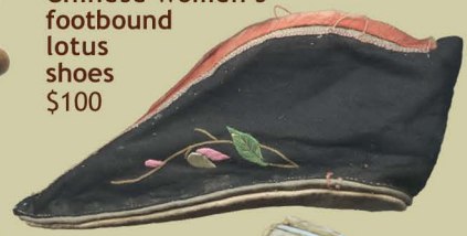
Chinese women's footbound lotus shoes $100