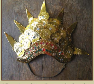
All prices listed are wholesale; retail prices are double.